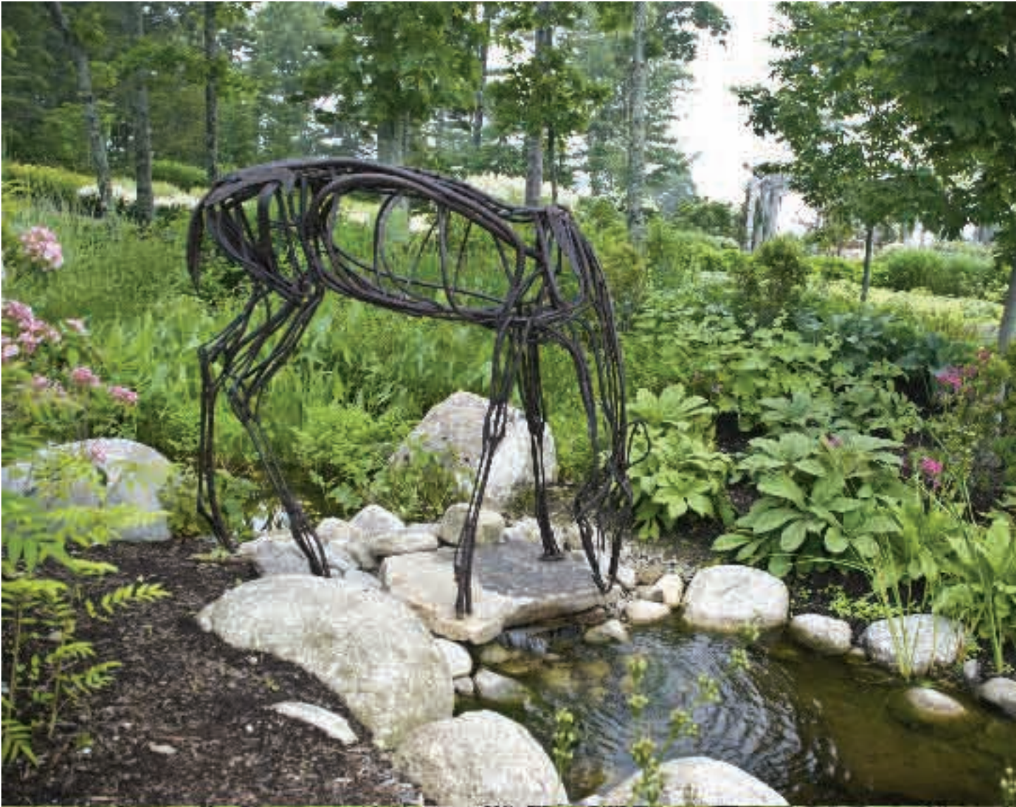
DRINKING DOE Salvaged steel (55 x 60 x 18)