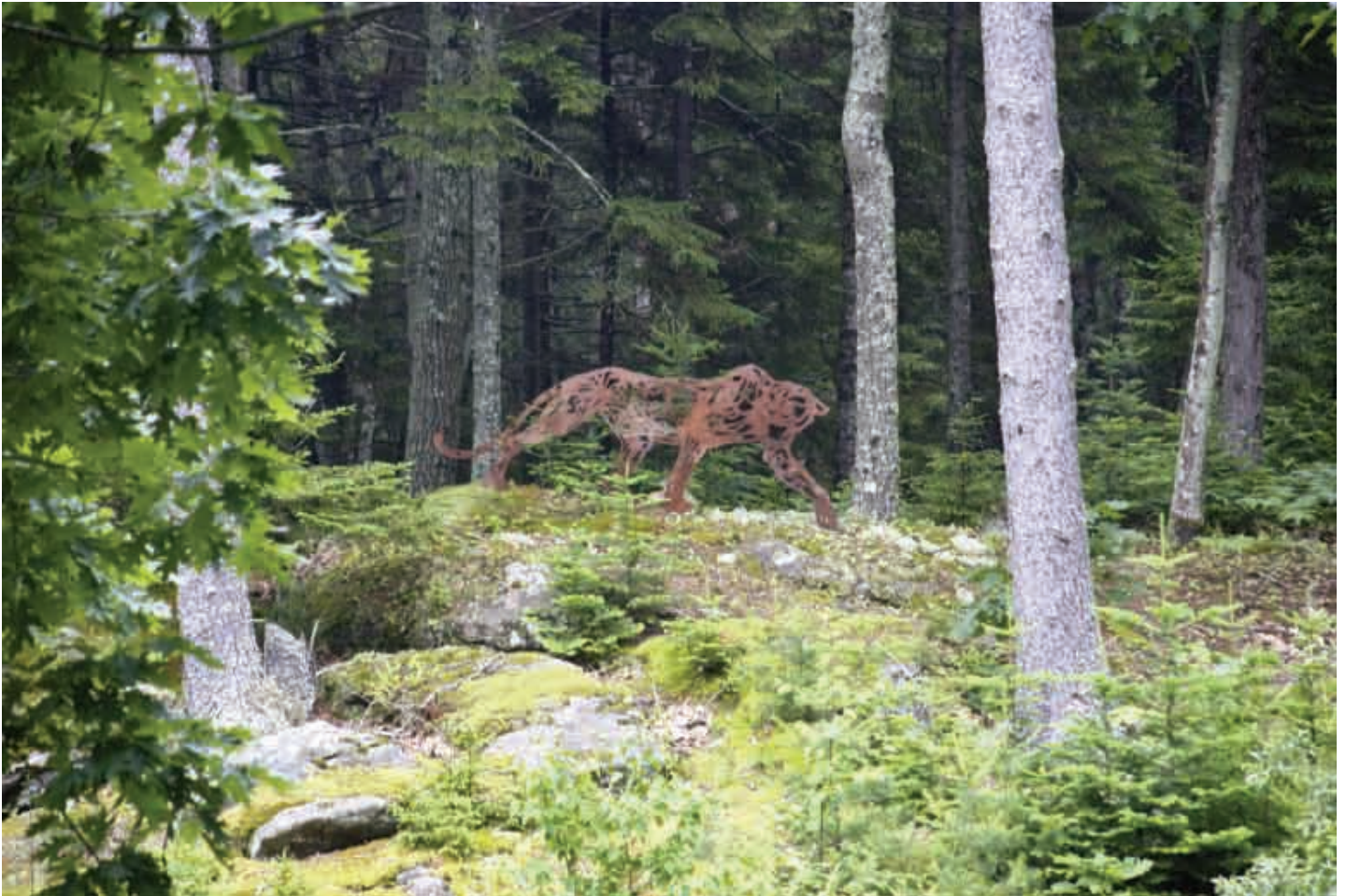
FELINE SHADOW Steel (36 x 96 x 1/8)