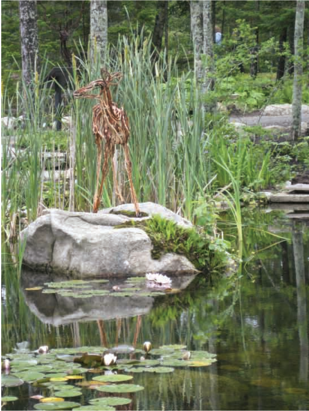
SPOTTED FAWN Salvaged steel, paint (50 x 55 x 30)