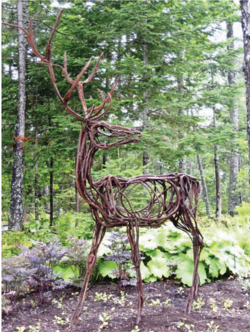
ALERT RED STAG Salvaged steel (102 x 96 x 60)