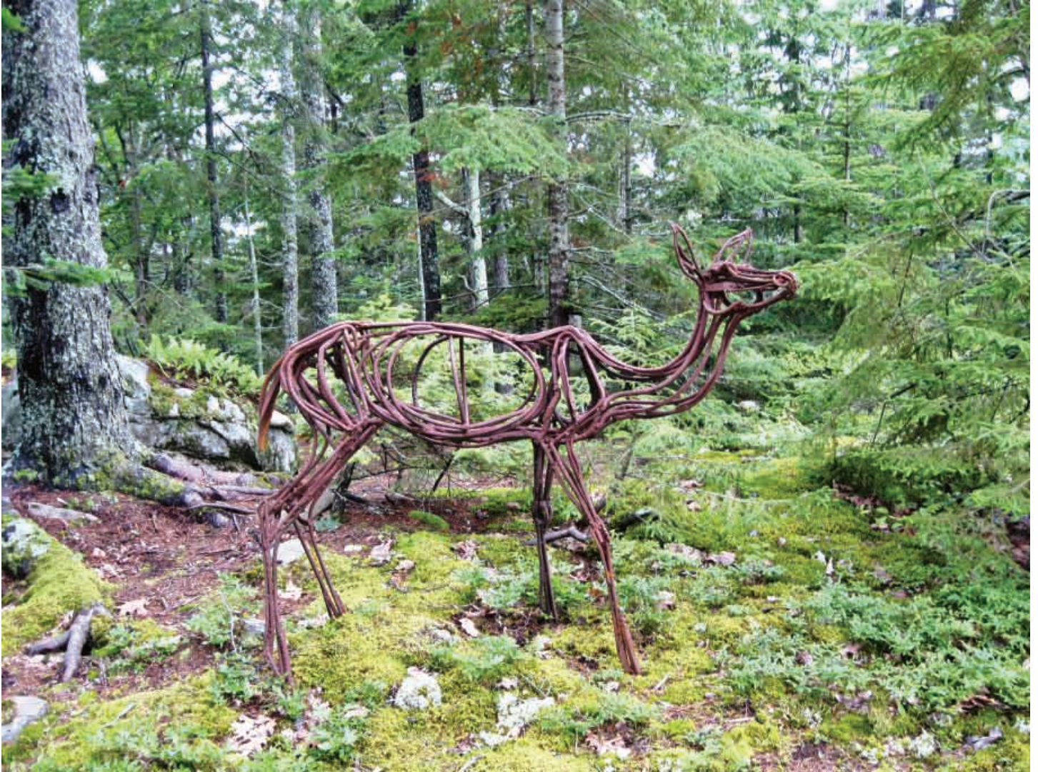
YEARLING Salvaged steel, paint (53 x 64 x 31)