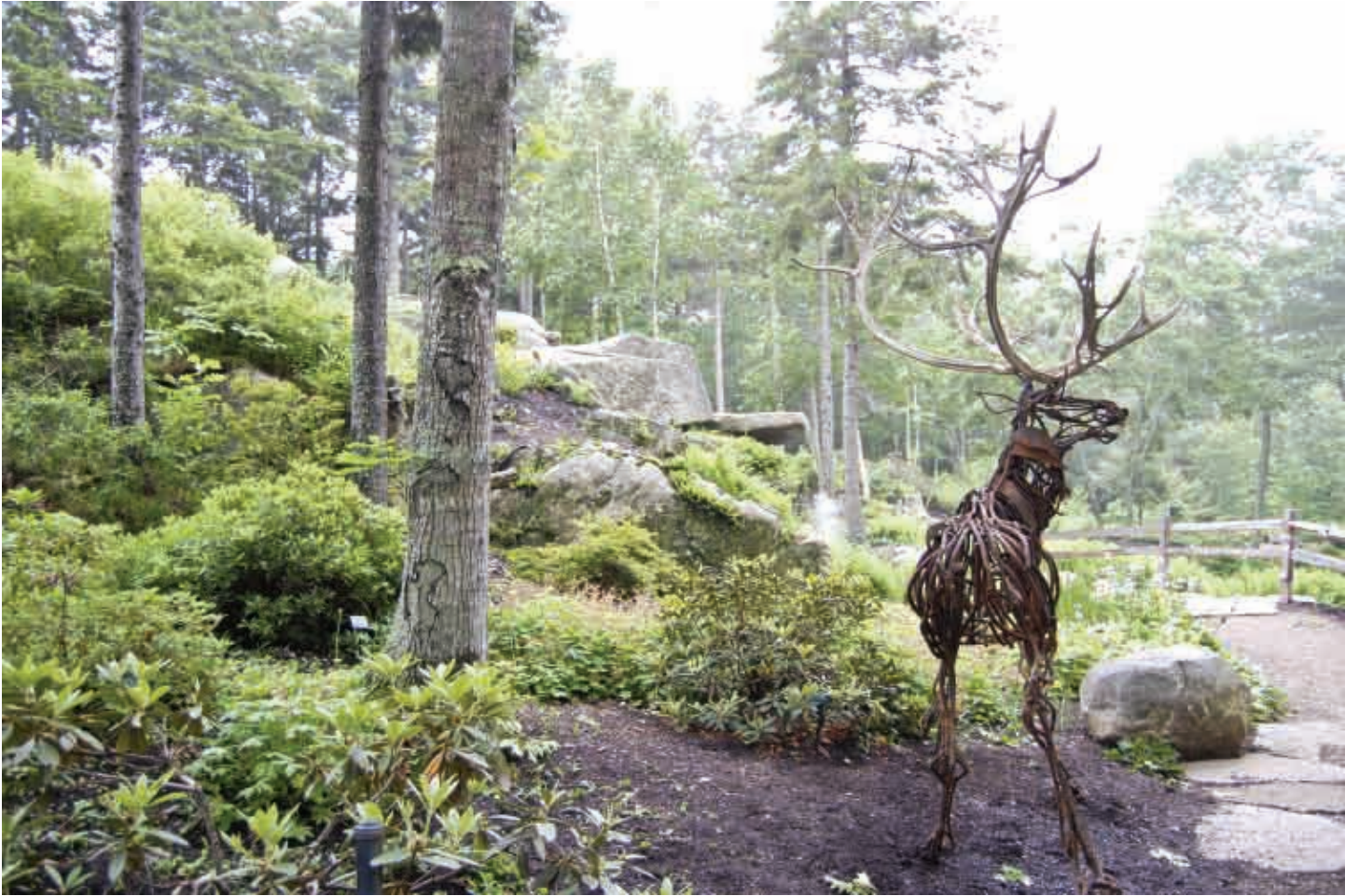
CARIBOU (IHUMATAQ) Salvaged Steel (138 x 106 x 80)