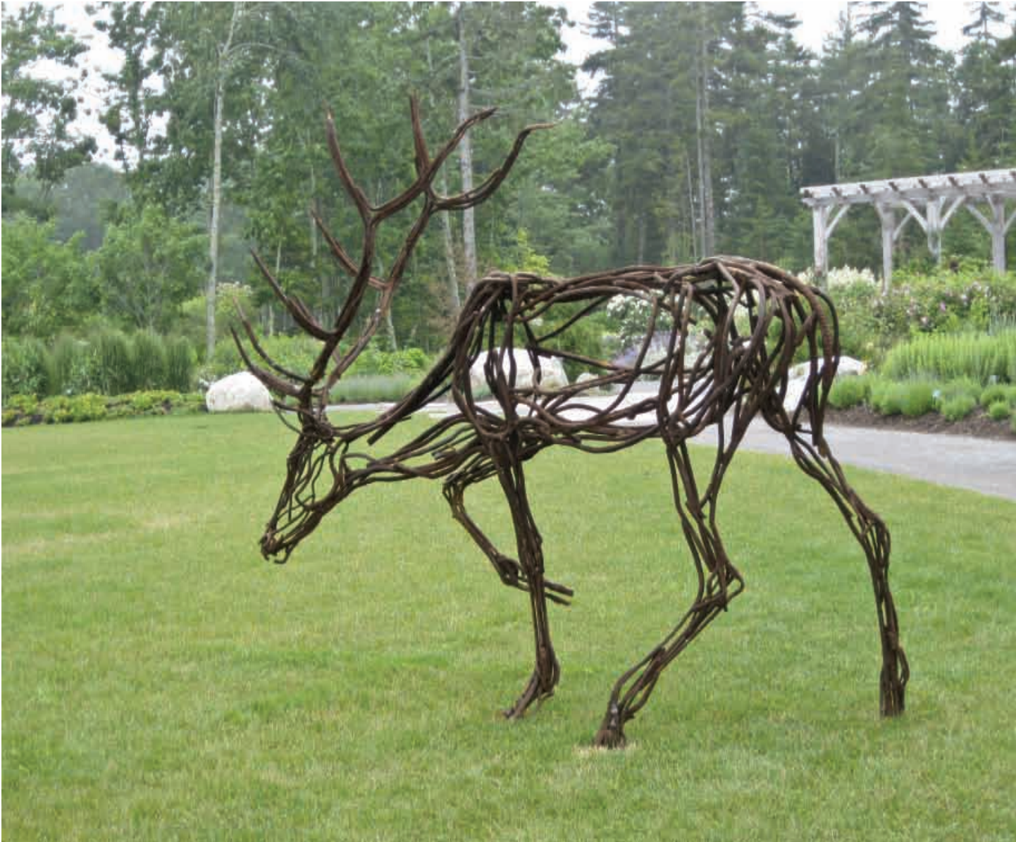
WALKING ELK Salvaged steel (93 x 108 x 44)