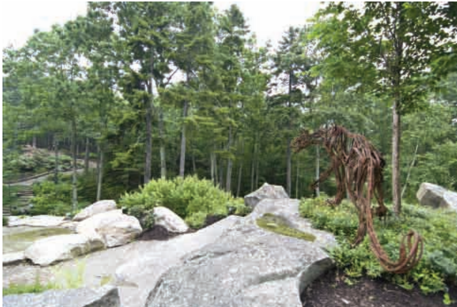
CATAMOUNT Salvaged Steel (60 x 120 x 56)