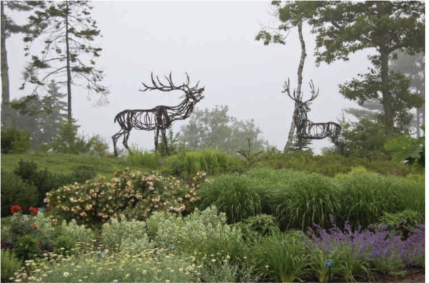
CALLING ELK, (117 x 112 x 70) TALL ELK (123 x 90 x 74) Salvaged steel