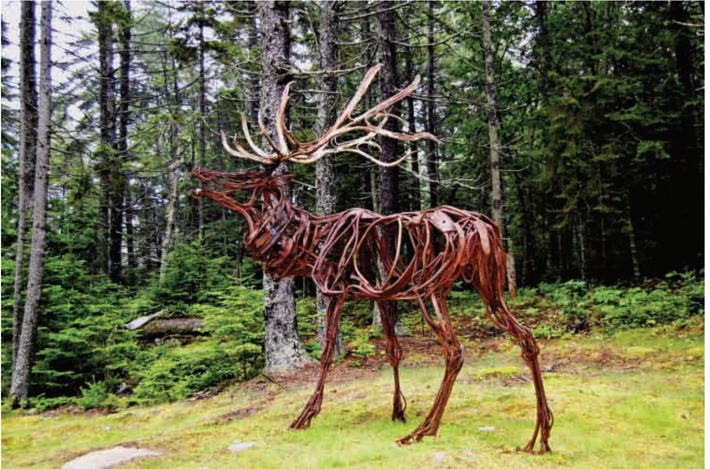
LARGE ELK salvaged steel, paint (121 x 118 x 96)