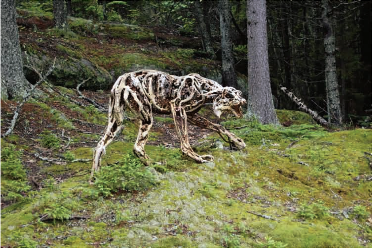
WHITE LYNX Salvaged steel, washers, chain, epoxy, paint (32 x 69 x 34)