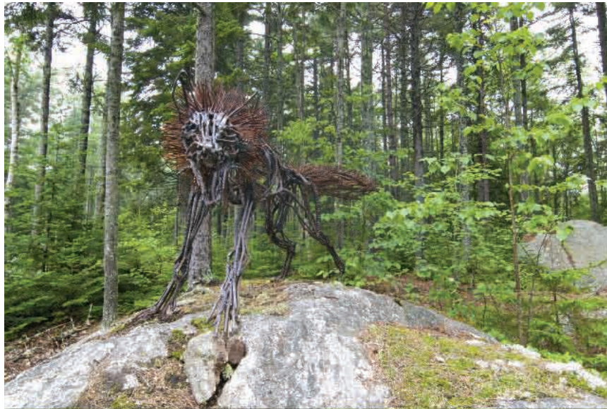
FENRIR (OMAR) Salvaged steel, nails (52 x 100 x 36)