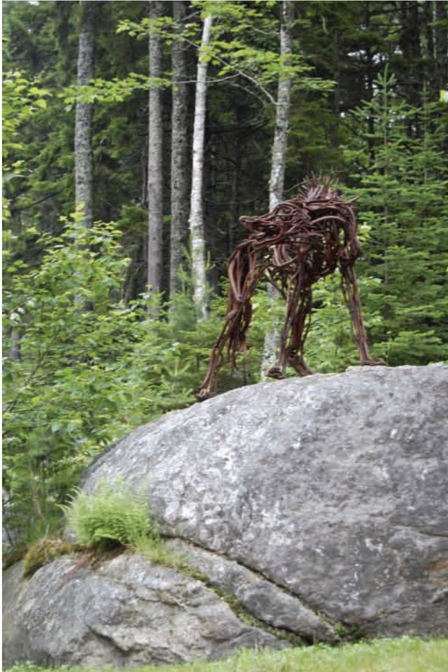
FIERCE WOLF Salvaged steel (50 x 81 x 36)