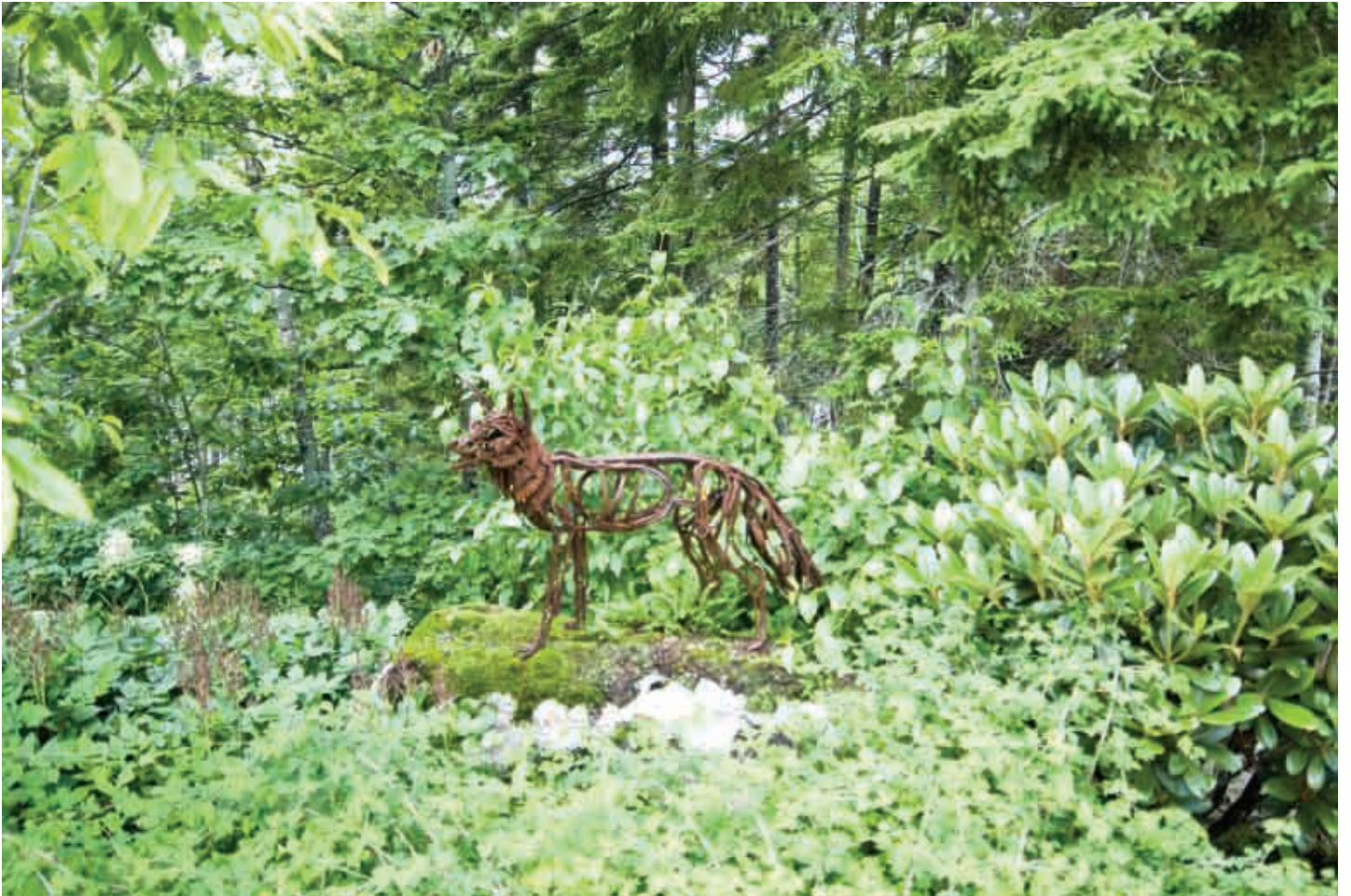
FOXY FOX (VULPES VULPES) Salvaged steel (32 x 48 x 14)