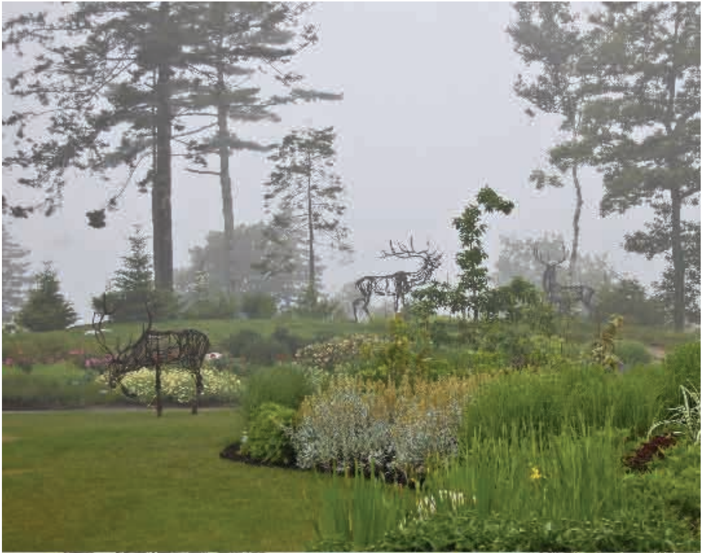
ELK HERD on Great Lawn