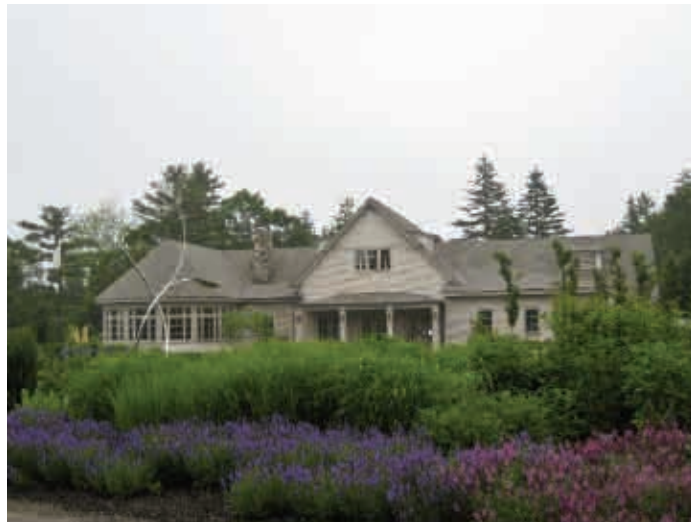
Coastal Maine Botanical Gardens Boothbay, Maine www.maine gardens.org