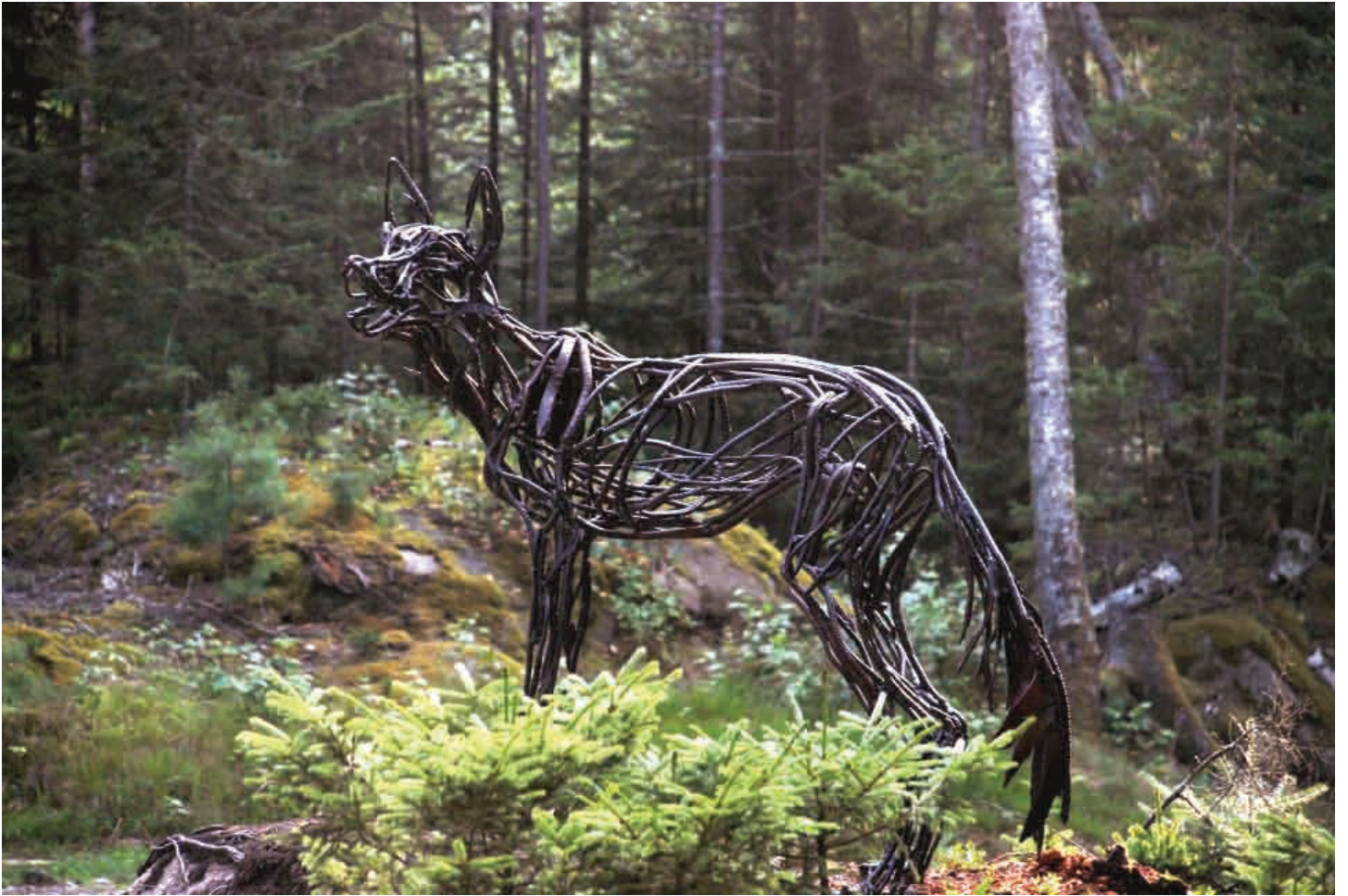
LOOKOUT WOLF salvaged steel (56 x 76 x 36)